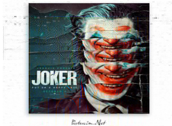
Figure 9: Joker Poster

Next, a verbal text, a form of the semiotic sign itself, was in the form of words 'Applause,' 'Everything must go,' 'Live! With Murray Franklin,' and the last word, 'Joker.' All verbal texts were representations of the Joker poster. The object of 'Applause' was a public cheer that supported the Joker in carrying out his evil actions. 'Everything must go' had the meaning of a demonstrator dressed as a clown asking the people around to leave the place. Then, it was the meaning of the verbal text 'live! With Murray Franklin' the incident would be broadcast live with Robert De Niro, an employee of Murray Franklin. Then in the Joker text, this was a verbal text that showed the actor of a Joker. The meaning of the Interpretation between the Representation and Object relations above was that this eighth poster showed each of the actors in this Joker film at a time when the city of Gotham was in chaos.