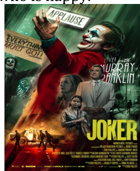
Figure 8: Joker Poster

Then, the index sign on the seventh data poster is a representation of Joaquin Phoenix who has a happy face and shows that he can repay all the treatment that has been done before by society by making the city of Gotham chaotic. Then, the semiosis process described above, the researcher finds an interpretation of the seventh poster's meaning or message that the advertising poster informs that on October 4, the Joker film will be released in the United States which will be directed by Todd Phillips and Joaquin Phoenix. And then the poster shows a joker who is happy.