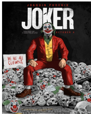
Figure 7: Joker Poster

The Joker poster in the seventh data showed one of the characters in the film scene. This poster contained visual and verbal signs. In the visual sign, a man was wearing a red shirt and trousers; on the person's chest, a combination of yellow and green was near his neck. The face of a man using make-up like a clown showed the face of a killer. Then around Joaquin Phoenix, there were many clown skull heads. Joaquin Phoenix's position was above the pile of skull heads; Joaquin Phoenix's expression showed happiness; his face was facing forward with his head raised. The symbols in the form of verbal text in the seven data were in the form of the words 'Joaquin Phoenix,' 'Joker,' 'a Todd Phillips film,' 'October 4', and 'we were clowns,' according to theory, they were words or verbal texts that were part of the Representation of the sign. The object of the verbal text was Joaquin Phoenix as a film actor, the Joker was the title of a film, Todd Phillips film was the director of the Joker film, then 'October 4' was the show date in all cinemas in the United States. Then the two had a relationship, so an interpretation of the meaning of Representation and object emerged. The Interpretation showed that Joaquin Phoenix was an actor in the Joker character directed by Todd Phillips, which would be shown in US theaters on October 4, 2019. The poster showed that Arthur Fleck could repay the actions of the surrounding community by causing chaos and destroying the city.