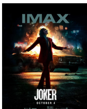
Figure 4. Joker Poster

This advertising poster provided an interpretation of the meaning and message conveyed, that the message in this poster advertisement is to provide information that on October 4 a masterpiece will be played by a professional actor with a bold story. and explosive, a Joaquin Phoenix plays the Joker story with ideas and saunters towards anarchy.