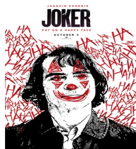
Figure 6: Joker Poster

The Index of a sign in data Picture 5 is a face representation stained with blood which makes Joaquin Phoenix feel gloomy and sad, and he changes himself as a scary Joker and makes him happy. An interpretation of the meaning or message of poster 5 that the advertising poster informed on the 4th October the Joker film will be released, to attract the attention of consumers. This poster is displayed with a Joker expression that is grim and sad.