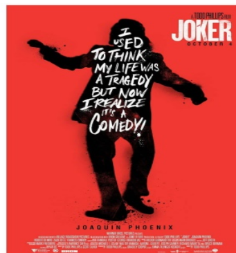
Figure 2: Joker Poster

From what has happened, this poster advertisement sends a message or meaning that the appearance of the Joker gives you a picture that the story in the Joker movie has a crime. Joker film tells about the killing against the rich. Then her face covered with color. As people have known a clown who covers his face not to show his real face.