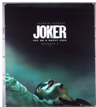
Figure 5: Joker Poster

Then the index from this 4D data is the Joker who is known as a frightening man, causing chaos causing the atmosphere in the city to crumble, fall apart and catch fire. From what the researchers have done, this ad sent a message or meaning that this advertisement poster showed one of the events that would occur in the Joker movie story, that the incident showed that there was chaos caused by the actions of a Joker.