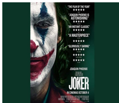
Figure 3: "Joker Poster"

From what has been seen, this advertisement sends a message or meaning that the story in the Joker film is Joaquin Phoenix who became an actor as the Joker in this film, where some of the stories explain about the dark and sad life he will experience, but he enjoyed his life happily with its own way. This poster ad also provides information that the film will be aired on October 4th.